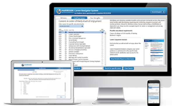
Online Interactive Career Portal